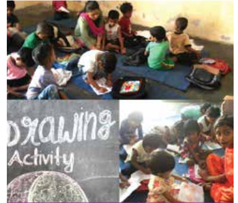
Summer activities at Godhuli Nangloi Centre.