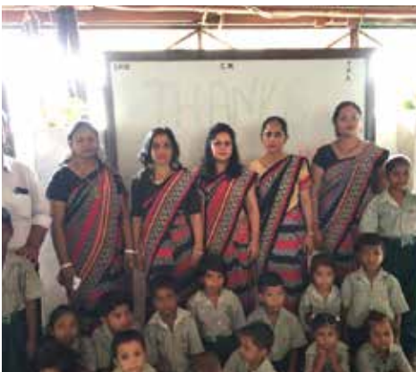
Teacher's day Celebrations at Meera Bagh Centre.