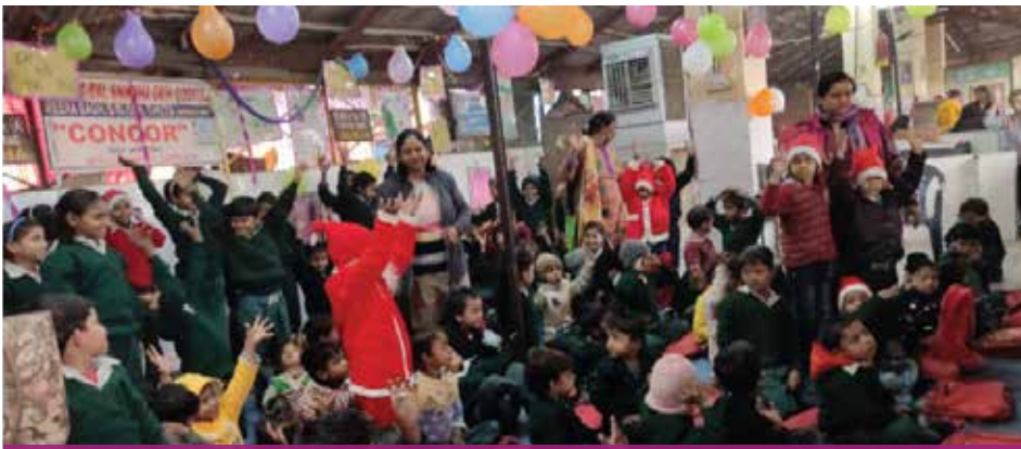
Christmas Celebration at Godhuli Meera Bagh Centre.