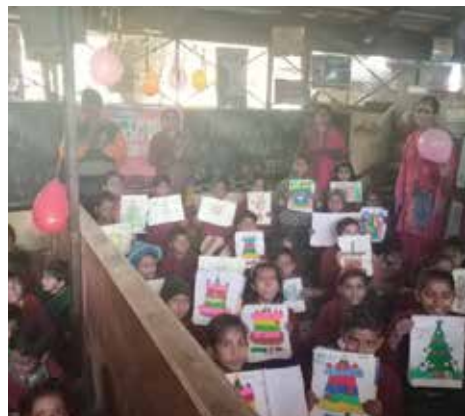
New Year celebration at Meera Bagh Centre