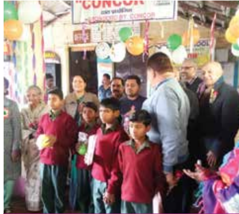
Republic Day Celebrations at Meera Bagh Centre.