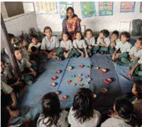
Diwali Celebration at Meera Bagh Centre