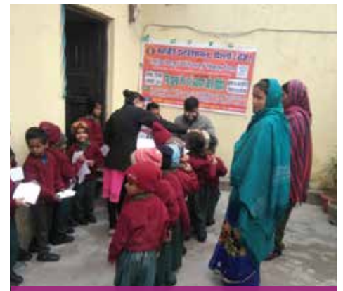
Dental and Eye check up at Nangloi Centre