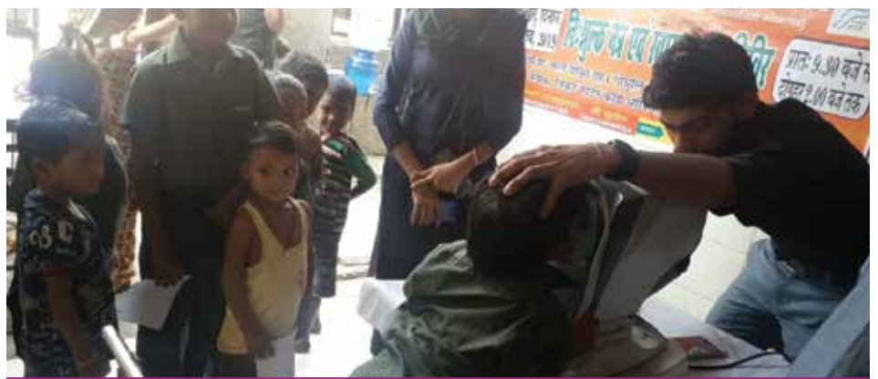
Medical Health Checkup Camp at Kalyanpuri Centre