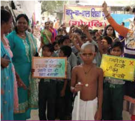
Gandhi Jayanti Celebrations at Meera Bagh Centre.