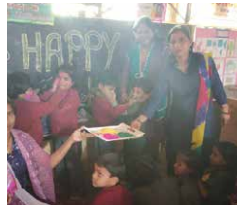
Holi Celebration at Meera Bagh Centre